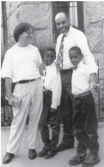
from 'Love Makes a Family' Exhibit See page 3 for details