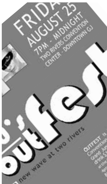
Events Update –see pages 6, 8